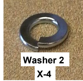
Washer 2 X-4